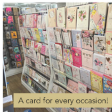
A card for every occasion!